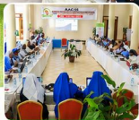
Strengthening the Network