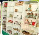
Counselling & Play Therapy